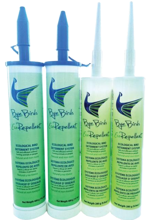
400g and 280g cartridges