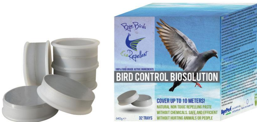
32 Prefilled trays