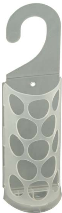
Assembled fly inn (geo pad holder)