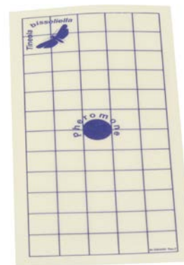
geopad green and geopad blu