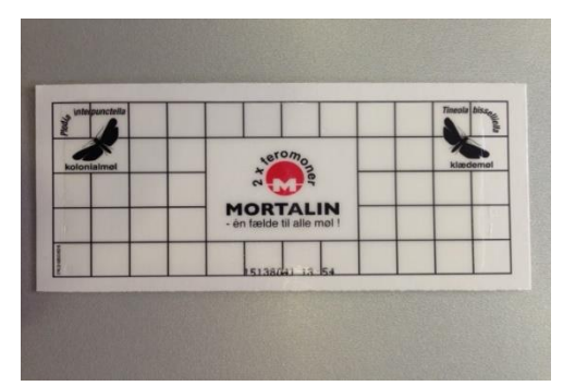
Geo Pad Combo Mortalin