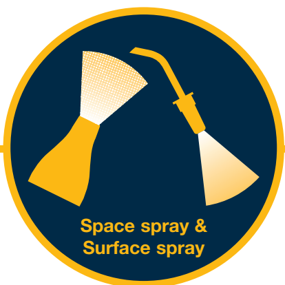
Space spray & Surface spray